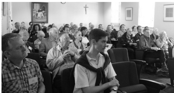
Part of the audience in Campion's main lecture hall