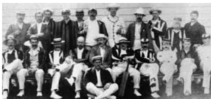
J.M. Barrie's cricket side, the Allahakbarries. There's no indication that Chesterton is present, though, curiously, the player seated third from the right, who is listed as J.M. Barrie in the photo, bears a passing resemblance to the young Chesterton!